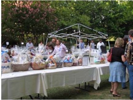
The Auction Table

SAHEC would also like to thank the following generous sponsors: