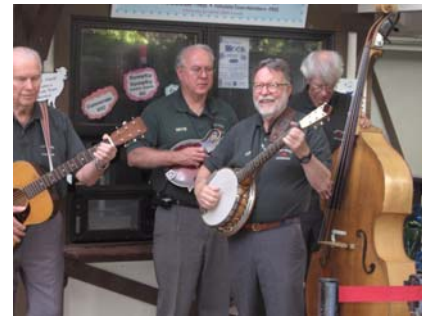
The Putah Creek Crawdads