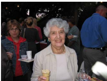
Former Mayor Anne Rudin

Major Donors ($5,000-$9,999) Sutter Medical Center, Sacramento