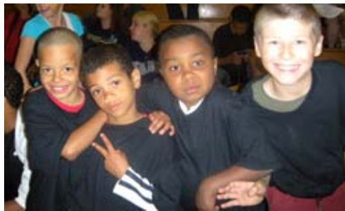
Go Team SAEHC!

A recent report from the National Center on Family Homelessness states that homeless children are twice as likely as other children to repeat a grade in school, to have disciplinary problems, or to drop out of high school. Few homeless students are proficient in reading and math, and their estimated graduation rate is below 25 percent.